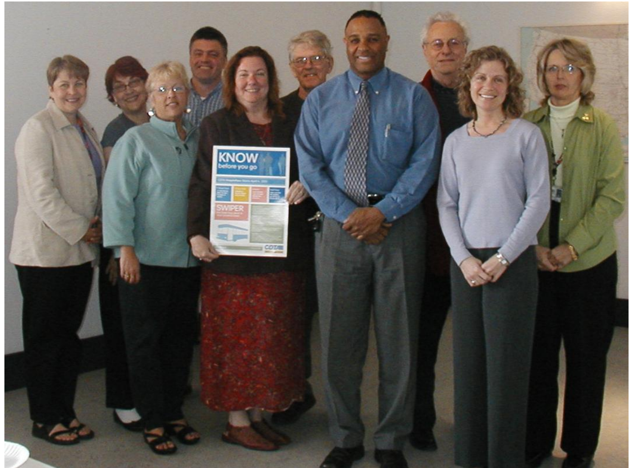
A Joint Meeting of Service Providers, Transportation Committee Members and CDTA Officials

Transportation providers came to the table to add to the dialogue.